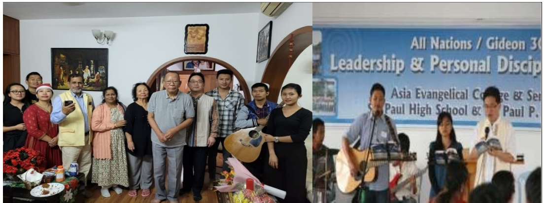
Annual Christmas Caroling Evangelism Fasting Prayer Personal Discipleship Training Seminar

The spiritual life of the students is nurtured by prayer, Bible reading, meditation and Sunday worship services. Life for the students begins in the early dawn of the day, with early morning watch at 5:30 AM. Spiritual life is strengthened by more informal gatherings for prayer and praise at various hours of the day. Speakers at the devotional services include the President and Faculty, Students, Pastors, and Missionaries from abroad.