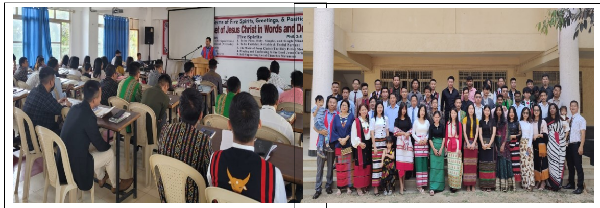
Morning Devotions & Worship Services are daily offered-up friendship in Christ