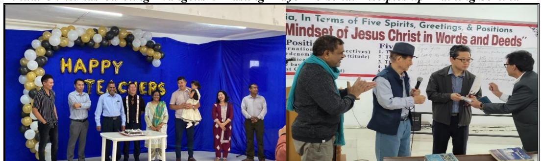
Teaching and administrative faculty members are well respected and appreciated at AECS