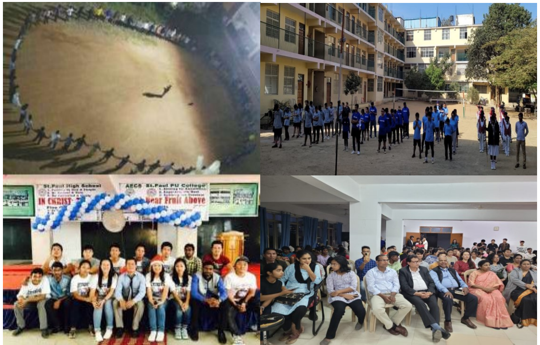
Human Cain Prayer and Sunday School Teachers

ASIA EVANGELICAL COLLEGE & SEMINARY endeavors to create an environment that is conducive for students' spiritual, mental, and physical well-being. In order to accomplish this essential task, the seminary holds morning devotions, chapel times, Sunday worship services, fasting prayers, Sunday School ministries, outreach ministry, Christmas caroling, evangelism and other